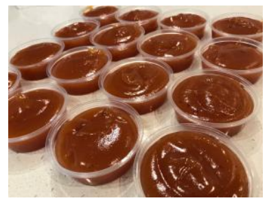
Vale Park Quince paste was popular at our Term 2 Harvest Stall.