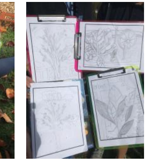
Vale Park had some junior Artists in residence doing Botanical drawings.