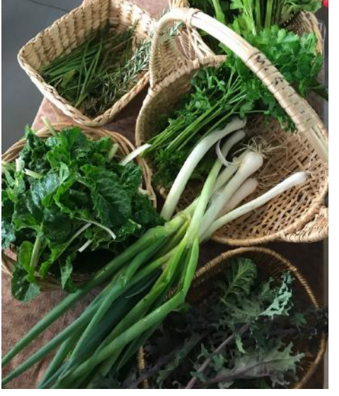
Winter greens Harvest